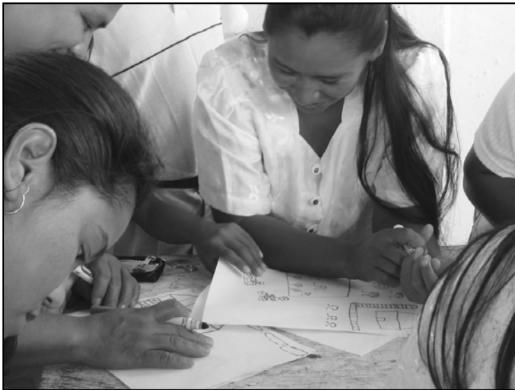
Figure 1: Women Drawing

I also engaged all the CBOs in several structured group activities which drew upon participatory rural appraisal techniques. 10 From my perspective and in relation to this article, one of the most interesting of these group activities was a drawing exercise (Fig. 1). I asked each woman to draw herself engaged in an activity that she saw as central to who she was as a woman . 11 This exercise merits some discussion here as a research method. My intention was to illuminate for myself and the women aspects of their gendered identities. It became clear during the exercise that the women shared their drawings with one another, laughing and drawing inspiration from one another. Upon reflection, I have decided that this sharing was altogether appropriate, as in fact, the identity processes in which I was most interested were the ones embedded in the group process itself—the collective reflection and construction of gendered identities within the context of the CBO and its goals. This led to a degree of uniformity of drawings specific to each group, but rather than detracting from the power of the exercise, I believe this outcome gives greater voice to the collectivity of the CBO. Thus the drawings capture a common moment in the identities of the women—identities which we know to be multi-faceted, shifting, and context-specific.