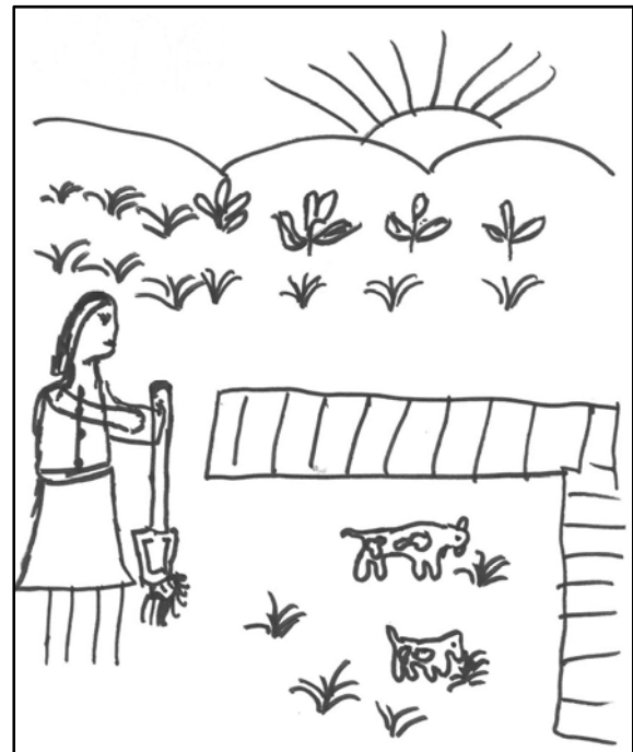
Figure 4: Example Drawing of Woman as Farmer