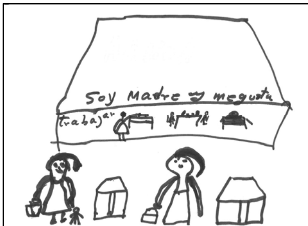
Figure 3: Example Drawing of Woman as Housewife

typically female-defined labor tasks of food preparation, childcare, cleaning, and the feeding of fowl in the house garden (see Fig. 3 for an example). Few women drew themselves engaged in agricultural field labor, but the majority of those who did were members of the Society of Farming Women. These women, specifically in the context of the group, drew themselves as farmers (see Fig. 4 for an example), not as housewives. Of the sixty-seven drawings I collected from the five women's CBOs in the three case study ejidos, twenty-one depicted women engaged in field labor on the parcel (either the CBO or the household parcel). For three of the CBOs, these types of drawings were few, but for two CBOs, including the Society of Farming Women in Nueva Esperanza, these drawings dominated. For the Society of Farming Women, in eleven of nineteen drawings the woman depicted herself as a farmer: With field labor defining who she is as a woman . It is important to note that based on the 100-household interview data, 65 % of women with households cultivating land, do engage in field labor—the choice of what to draw reflects not so much what the woman does in an average workday. The choice of what to draw reflects a decision (at that particular time and place, with me and in the group) of how to define herself, how to represent herself.